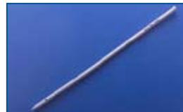
Phillips Bougie Followers Made of polymer with standard fittings, 34cm in length for 8-10FR, or 36cm in length for 12-24FR, with a 1/56" male thread, either reusable (if you are able to sterilize properly) or disposable.