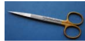
5" Stainless Steel Scissors #03-035