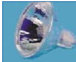
DNE 120 volt, 150 watt halogen light bulb