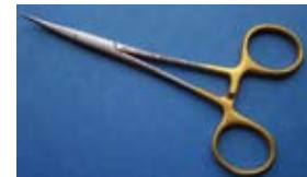
Stainless Steel Clamp cvd/sharp #28-300