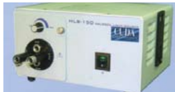
HLS-150 Brilliant, high intensity light with single 250W quartz halogen lamp. Available with single port or four port turret. (ACMI, Wolf, Storz, Olympus)