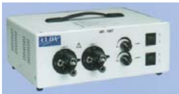
MD-150T Domestic and international halogen lightsource, 150 watt, dual active lamp, four port turret. (ACMI, Storz, Wolf and Olympus)

We have a lightsource that will fit all endoscope makers instruments. A Xenon lightsource for your photography.