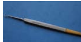
Stainless Steel Hooklet #10-200

No-scalpel vasectomy – This method of vasectomy, which was developed in china, does not use a scalpel. After the anesthetic is injected, the doctor pierces the skin of the scrotum with a sharp clamp, and then gently stretches the opening so that the tubes can be reached and blocked. No stitches are needed to close the tiny holes. There is very little blood and fewer complications than when the scalpel is used. This procedure accounts for nearly one-third of all vasectomies in the United States.