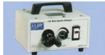
MT-150 Domestic halogen lightsource, 150 watt, single turret. (ACMI, Storz, Wolf and Olympus)