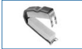
Cunningham Incontinence Clamp A hinged, stainless steel frame supporting two foam-rubber pads and a locking device. #U414