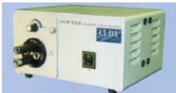
HLS-250 Brilliant, high intensity light with single 250W quartz halogen lamp. Available with single port or four port turret. (ACMI, Wolf, Storz, Olympus)