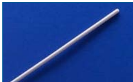
Straight-Tip Filiforms Made of PVC, 33cm in length, with a 1/56" female thread, available in 3-6FR, either reusable (if you are able to sterilize properly) or disposable.