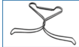
Zipser Meatus Clamp Surgical Grade Stainless Steel #U413