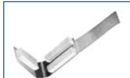
Baumrucker Incontinence Clamp - Universal Fit Plastic frame supporting three foam-rubber pads and a velcro locking device. #U415