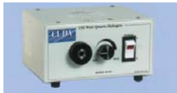
M-150 Domestic halogen lightsource, 150 watt, single ACMI port.