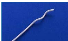
Spiral-Tip Filiforms Made of PVC, 33cm in length, with a 1/56" female thread, available in 3-6FR, either reusable (if you are able to sterilize properly) or disposable.