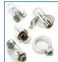
An assortment of other available bulbs for your lightsource or microscope.