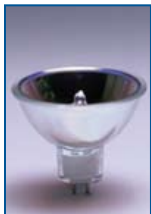
EJA-DNF 21 volt, 150 watt halogen light bulb