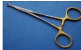
Stainless Steel Loop/Ring Clamp #28-305