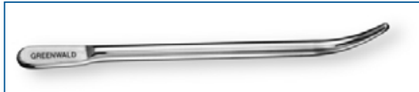
McCrae Female Sound Surgical Grade Stainless Steel. 6" working length 8FR - 30FR - #U340