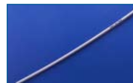
Phillips Catheter Followers Made of polymer with standard fittings, with one eye, 34cm in length for 8-10FR, or 36cm in length for 12-30FR, with a 1/56" male thread, either reusable (if you are able to sterilize properly) or disposable.